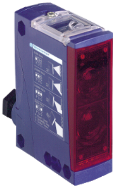
photo-electric sensor - XUX - polarised - Sn 11m - 24..240VAC/ DC - terminals