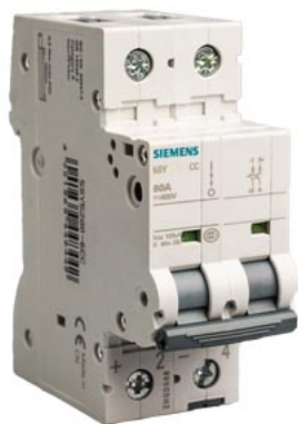
Miniature circuit breaker 400 V 10kA, 2-pole, C, 80 A