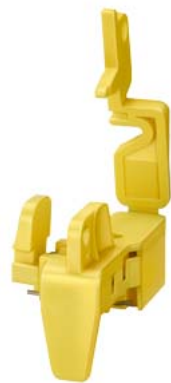
Locking device for handle for miniature circuit breaker for 5SY, 5SP, 5TE8, 5SJ4...-HG..