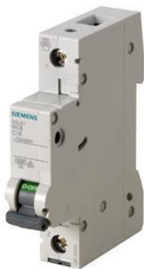
MCB 13A 1-pole C characteristic 7.5 kA