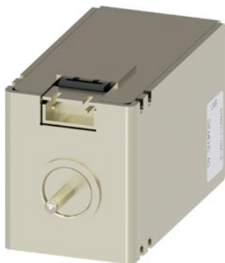
undervoltage release UVR 415-440 V AC accessory for circuit breaker 3WL10 / 3VA27