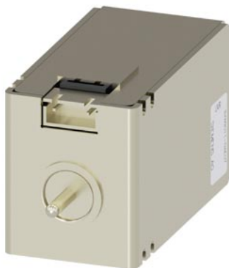
undervoltage release UVR 220...240 V AC/DC accessory for circuit breaker 3WL10 / 3VA27