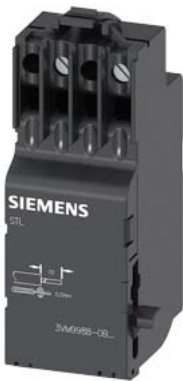
shunt trip left 24 V AC 50/60Hz / 12-30 V DC accessory for: 3VM10-3VM14