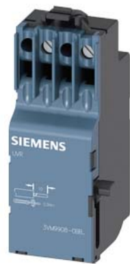
undervoltage release 24 V DC accessory for: 3VM10-3VM14