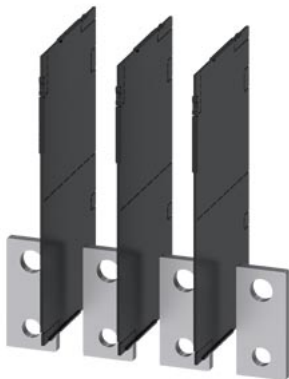
bus connector extended front mounted; 4 units for India accessory for: 3VM13/14