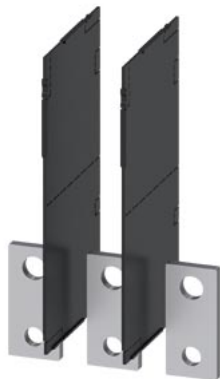
bus connector extended front mounted; 3 units for India accessory for: 3VM13/14