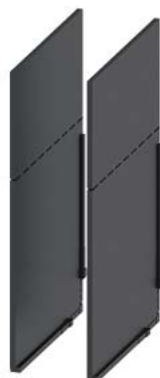
phase barriers; 2 units accessory for: 3VM10/11