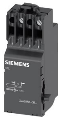
shunt trip left 208-277 V AC 50/60 Hz 220-250 V DC accessory for: 3VA1; 3VA20-26