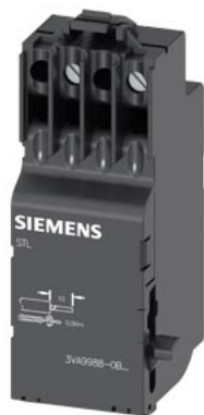
shunt trip left 380-600 V AC 50/60 Hz accessory for: 3VA1 and 3VA20-26