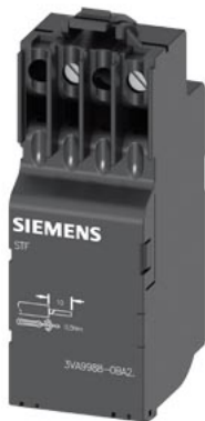
shunt trip flexible 110-127 V AC 50/60 Hz accessory for: 3VA1 and 3VA20-26