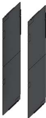
phase barriers; 2 units accessory for: 3VA13/14; 3VA23/24