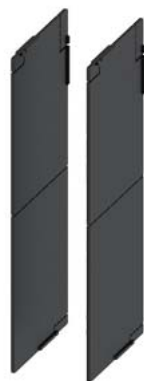
phase barriers; 2 units accessory for: 3VA20/21/22