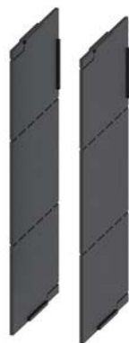
phase barriers; 2 units accessory for: 3VA12