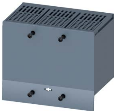
terminal cover extended 3-pole; 1 unit accessory for: 3VA12