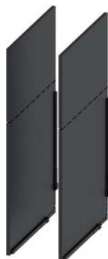
phase barriers; 2 units accessory for: 3VA10/11