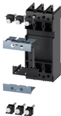
plug-in unit complete kit accessory for: circuit breaker, 3-pole 3VA11