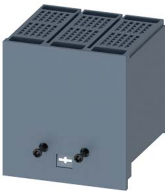
terminal cover extended 3-pole; 1 unit accessory for: 3VA10/11