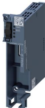
communication module PROFIBUS