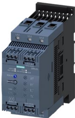
SIRIUS soft starter S3 80 A, 45 kW/400 V, 40 °C 200-480 V AC, 24 V AC/DC Screw terminals