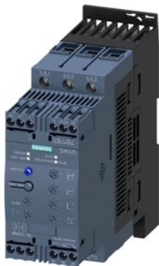
SIRIUS soft starter S2 72 A, 37 kW/400 V, 40 °C 200-480 V AC, 24 V AC/DC Screw terminals