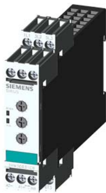
SIRIUS soft starter 22.5mm 3 A, 1.1 kW/400 V, 40 °C 200-400 V AC, 24-230 V AC/DC Screw terminals