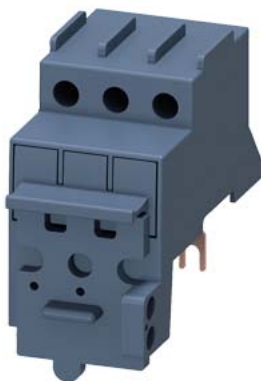
Disconnecter module for circuit breaker Size S00/S0