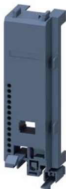
Contactor base size S00/S0