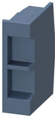
End cover for 3-phase busbar 3RV2917 Multi-unit packaging 10 units