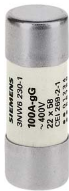
SETRON, cylindrical fuse link, 22x58 mm, 100 A, gG, Un AC: 500 V