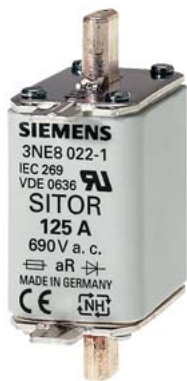
SITOR fuse link, with blade contacts, NH00, In: 125 A, aR, Un AC: 690 V, Un DC: 440 V, front indicator