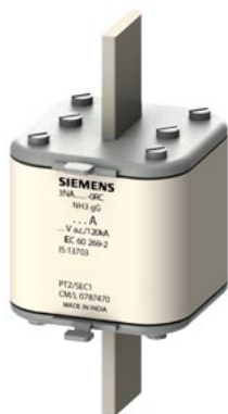
LV HRC fuse element, NH3, In: 500 A, gG, Un AC: 690 V, Un DC: 440 V, Front indicator, live grip lugs