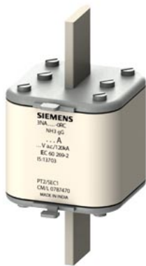
LV HRC fuse element, NH3, In: 400 A, gG, Un AC: 690 V, Un DC: 440 V, Front indicator, live grip lugs