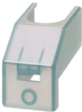
Terminal cover, 1-pole, for 100 A and 125 A, accessory for Main and emergency switching-off switch 3LD2